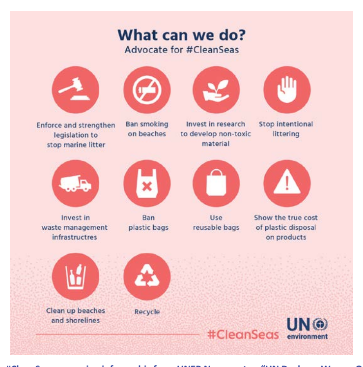
Figure 1: #CleanSeas campaign infographic from UNEP Newscentre, "UN Declares War on Ocean Plastic" (23 February 2017) http://web.unep.org/newscentre/un-declares-war-ocean-plastic