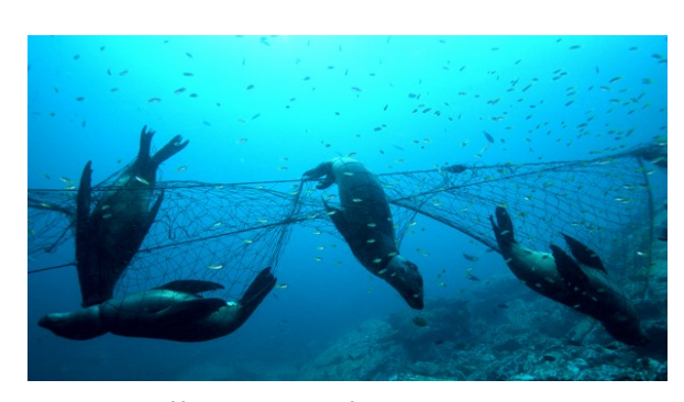
Figure 3: http://cetussociety.org/marine-stewardshipprograms/derelict-fishing-gear/

Derelict fishing gear -- sometimes termed ghost fishing gear -- is lost or abandoned fishing gear such as nets, lines, crab and shrimp traps/pots. 120 Fishers don't typically lose expensive fishing gear on purpose, but gear can get hooked up on passing vessels, dragged into deeper water, or a vessel propeller can cut the buoy line making gear impossible to find. When made of synthetic materials and plastics, such gear can take hundreds of years to decompose. 121 Yet the lost gear —which is specifically designed to entrap